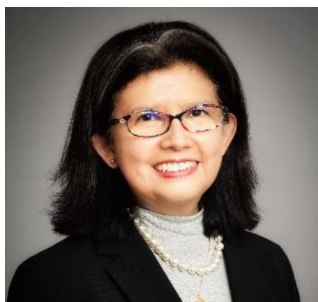
Cecilia Ugaz Estrada

Director of the Gender Equality and Empowerment of Women Unit at UNIDO